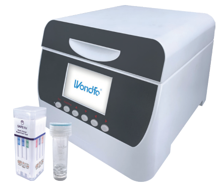
* For Forensic Use Only